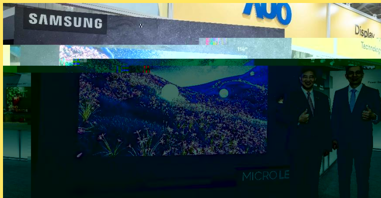
Samsung 114" Micro LED TV