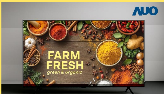
65" 8K FSC LCD