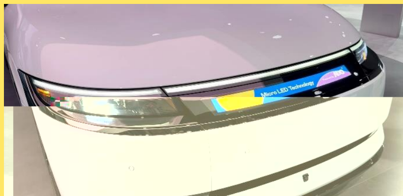
Micro LED media bar for AFEELA