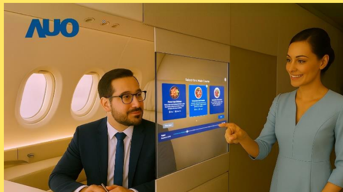
17.3" dual-side transparent Micro LED